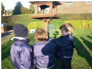
Lower Prep “Feeding the birds”